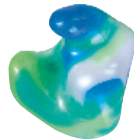
Aqua Seal Glazed