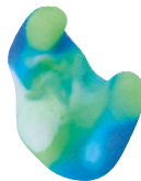
Aqua Seal Matte