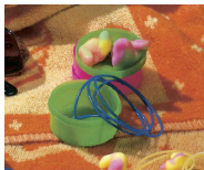
Aqua Seal Molds

Portions of Article courtesy of Westone Labs, June 2008 newsletter