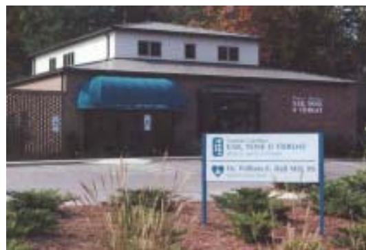
1915 KM Wicker Drive Sanford, NC 27330