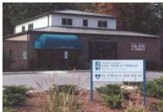
1915 KM Wicker Drive Sanford, NC 27330