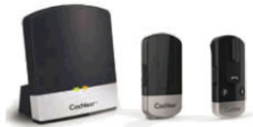
Wireless accessories for TV, Remote mic, and phone clip